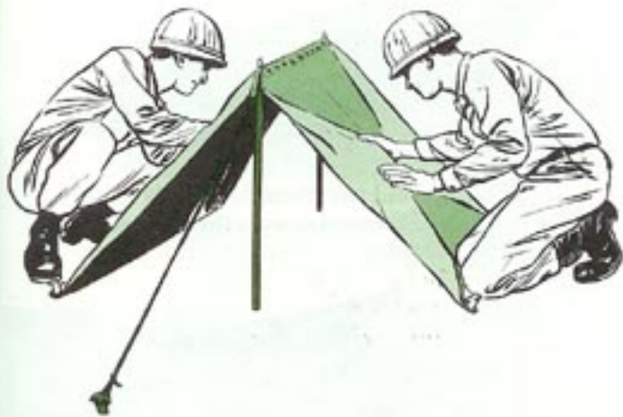
Procedures for pitching shelter half tent

* INSTEAD OF CLOSING ENDS, THEY MAY BE FOLDED BACK FOR VENTILATION.