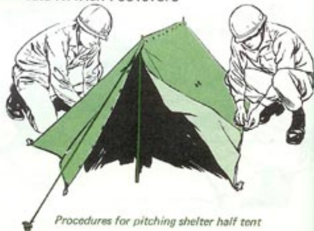
Procedures for pitching shelter half tent

4 DRIVE SIDE CENTER PINS AND ATTACH FOOTSTOPS